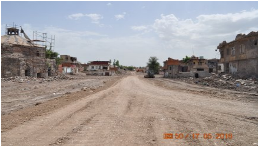
Photo 9: The Yenikapi street, with an original width of 8m before the demolition, has been turned into a 15 m wide street.