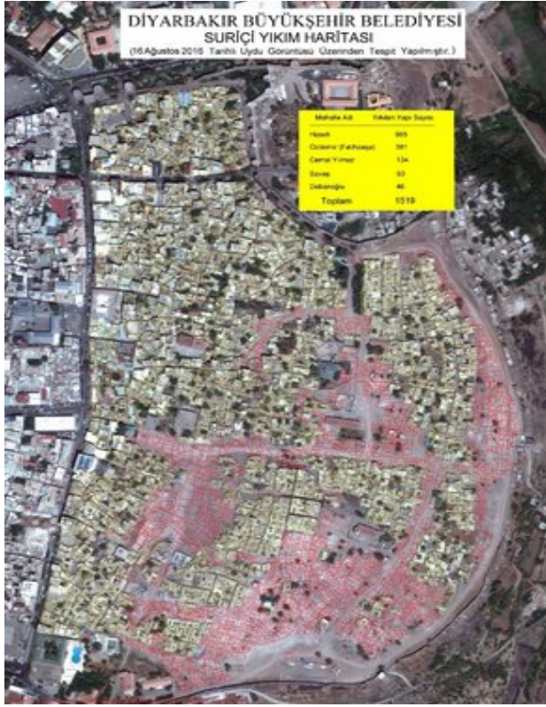
Map 4: Satellite image illustrating demolition in the old city. August 16, 2016

From the satellite image of August 16, 2016 it has been assessed that a total of 1519 buildings and other constructions have been destroyed completely, among them registered civil and monumental buildings. 89 registered monuments have been destroyed completely and 40 partially. 41 monuments have only been damaged. Of these registered structures 76 are of civil, 13 of monumental and 81 marked as environmentally significant buildings. These numbers are growing every day.