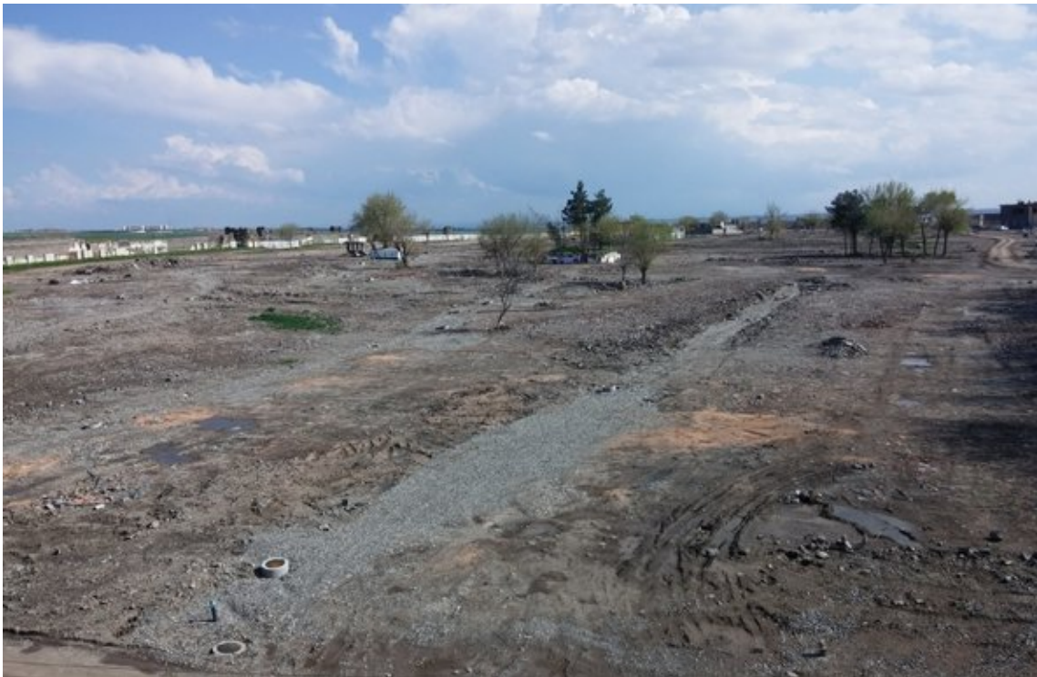
Photo 19: Inside the walled old city, erased and turned into a flatland; April 19, 2017