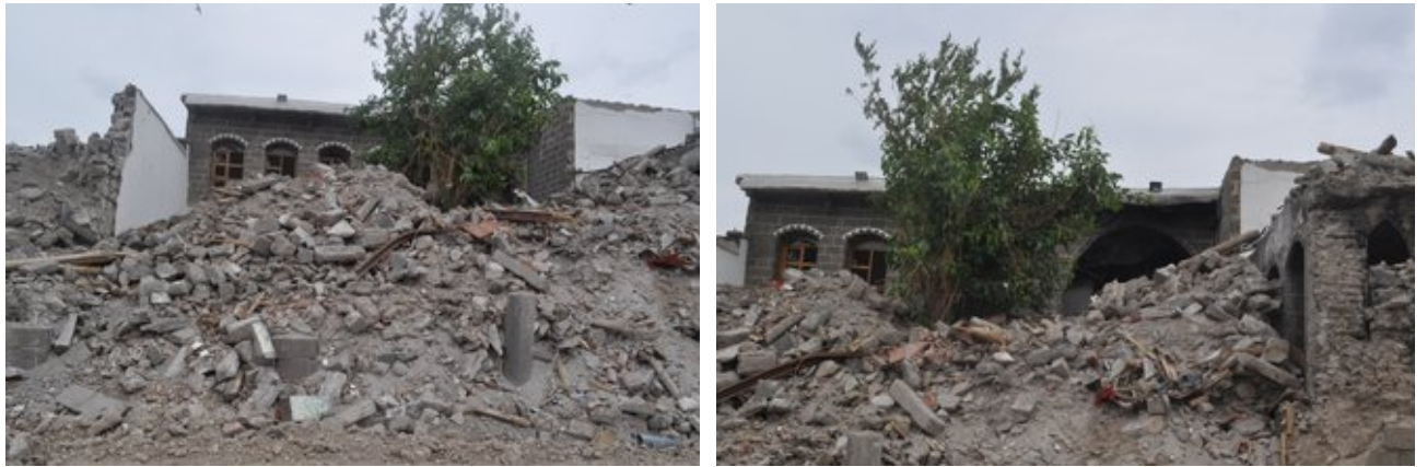
Photo 8: View at the registered building belonging to the Chamber of Trade and Industry; May 2016

The southern part of the building of the Chamber of Trade and Industry has been demolished in order to widen the Yenikapi Street, which connects the center with the eastern gate Dicle.