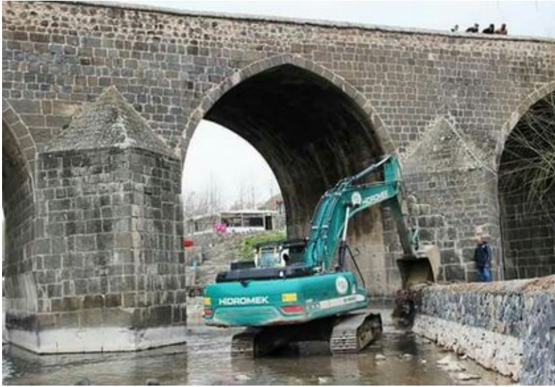
Photo 23: Work being conducted at the Ten Arches Bridge, part of the Diyarbakir World Heritage Cultural Landscape; March 26, 2017