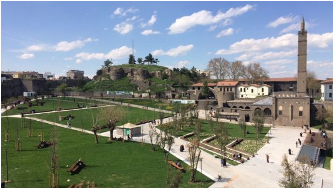
Photo 28: The modern park in the Inner Fortress. The registered building next to the mosque (see Photo 27) has been removed completely.