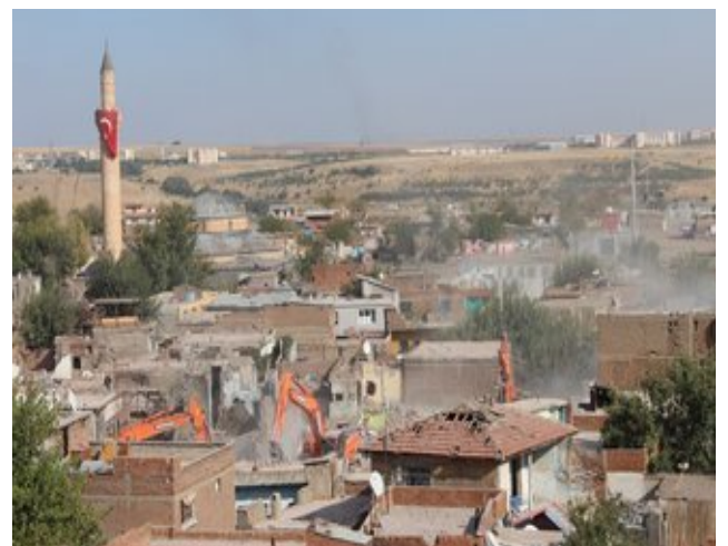
Photo 10: Excavators in the Yeni Kapı Street Photo 11: Destruction behind Kurşunlu Mosque, May 2016