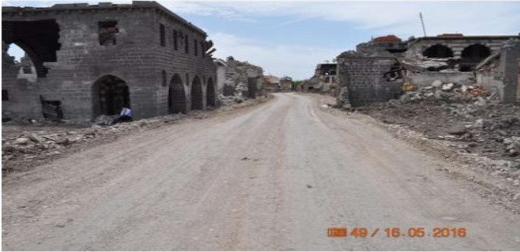
Photo 5: the opened road through the area of the Armenian Catholic Church; May 16, 2016