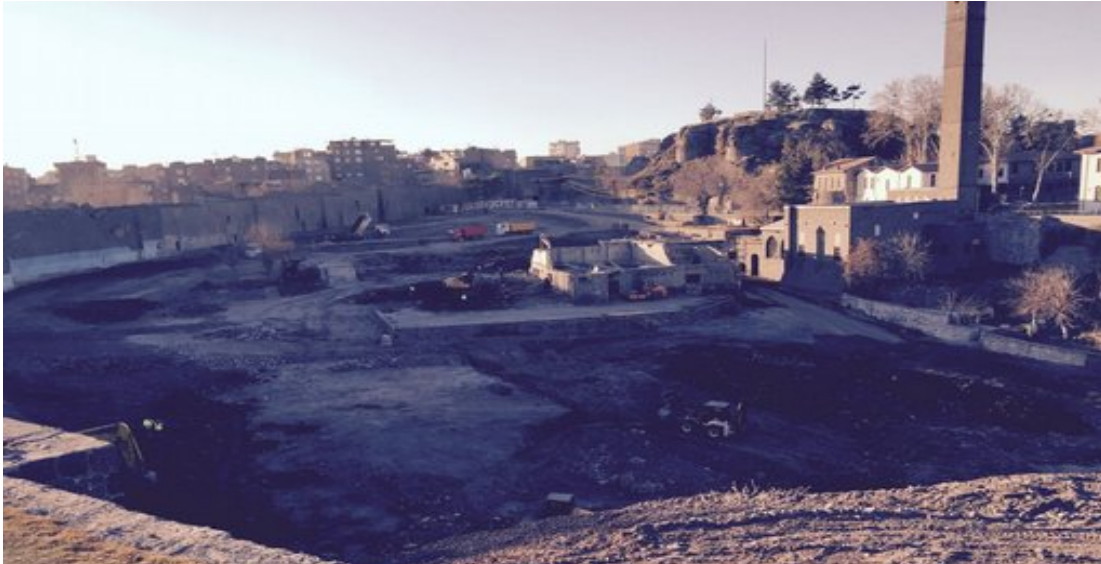
Photo 27: View at the registered building next to the Ickale Mosque, Inner Castle. After deregistration it has been demolished

well as was highlighted in the Site Management Plan. What we observe nowadays is that in the area of the second stage of the project all buildings of low quality have been removed and a registered building has been de-registered and then immediately demolished. The cleared space has been designed as a modern park. Meanwhile with heavy equipment excavations have been conducted and many trees with extensive roots have been planted. All of these interventions have the high probability of damaging the archaeological structures under the earth.