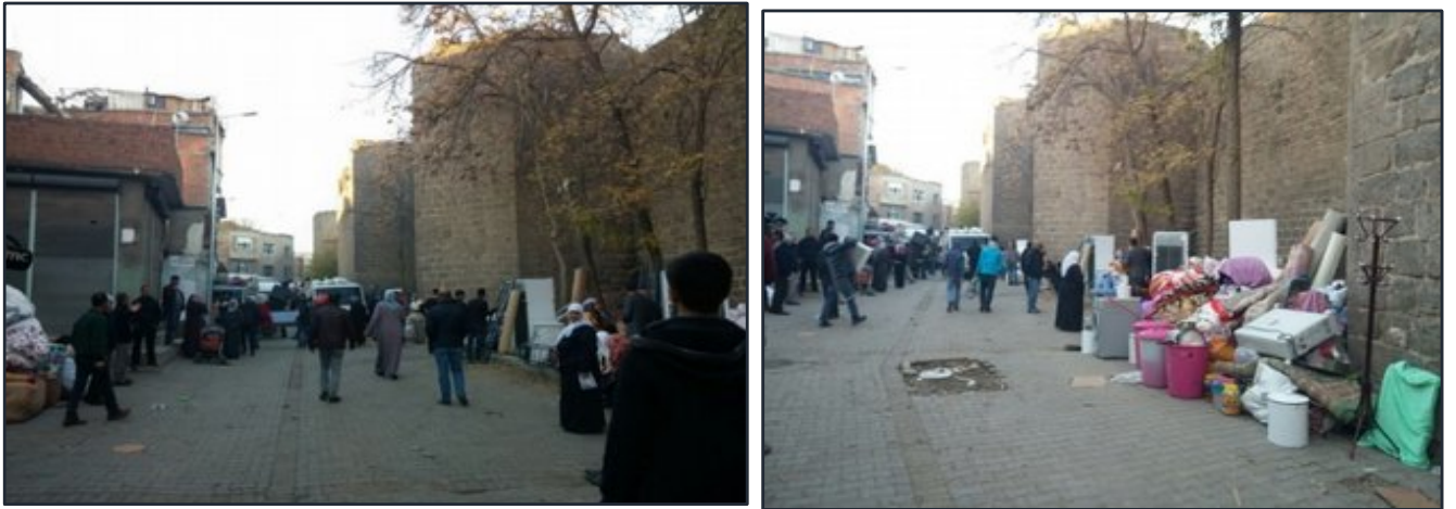
Photos 21 and 22: Images of forced eviction from the blockaded quarters, December 10, 2015

partly in the Abdaldede neighborhoods and the residents could return to their homes. The large part of the five other neighborhoods, where the blockade continues, has been turned into barren land as a result of the intended systematic demolition. This policy has both destroyed the civil constructions and monuments and interrupted the continuity of life in the eastern half of the old city.