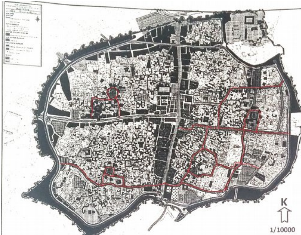
Map 7: Revised Suriçi Urban Conservation Plan; December 2016