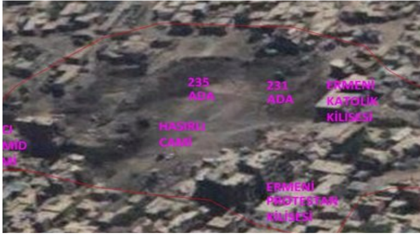
Photo 2: Aerial photographs underline that the Hasırlı Mosque, located at parcel no. 235/19 has been completely destroyed and the debris removed, without a trace left in its place.