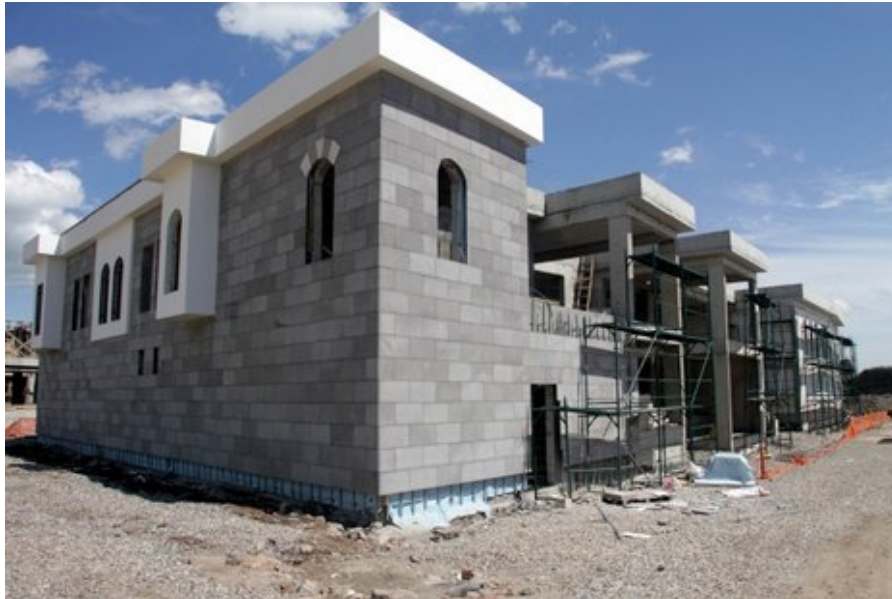
Photo 26: In spite of the stipulation by the conservation Plan, that concrete houses with a deceptive thin stone facing are not to be allowed, the picture shows new reinforced concrete houses coated with basaltic slabs.