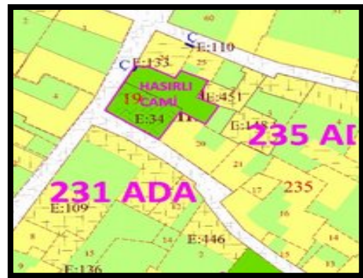
Map 1: Street location of Hasırlı Cami