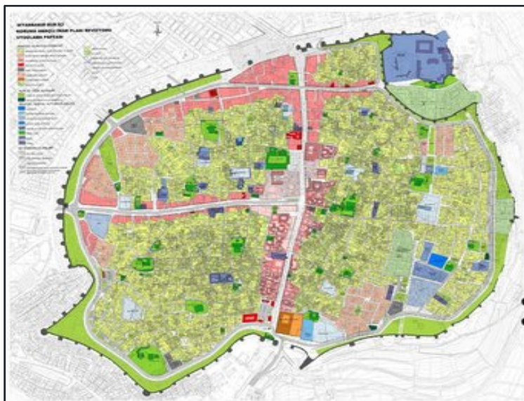
Map 6: Revised Suriçi Urban Conservation Plan from 2012

In the KAIPD explanatory report, as a justification for the widening of and new streets, it is stated that "streets to allow the passage of vehicles for security and services, fire engines and ambulances are not available.” However, in the Revised Urban Conservation Plan (KAIPD) it is obviously seen that the new streets serve only the "Security Service Areas" foreseen in the plan revision. Moreover, in an environment like Suriçi, with an ancient urban fabric, public services such as firefighting or ambulatory services could very well be met by modern technological innovations; instead, what is being done in the KAIPD decisions is to try to legitimize demolitions clearly in conflict with conservation principles, by putting forward certain public needs.