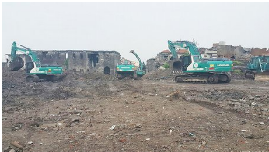
Photo 4: The destruction resulting from razing a road through the church; March 2016